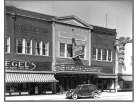
DOWNTOWN MOVIE THEATERS

ben the Orphrum opened in 1903 at 285 South Main Storet, the event drew such a crossed that people had to be turned savey. Constructed by Gothlers J. Ford Worstell, it was the first lineater in how built to show movies. Earlier, con-reed films were shown in streetfeort includedoons like the Stor at 118 East Washington Storet (lower right). Abvertised as "tumily entertainment," many shown included live acts.