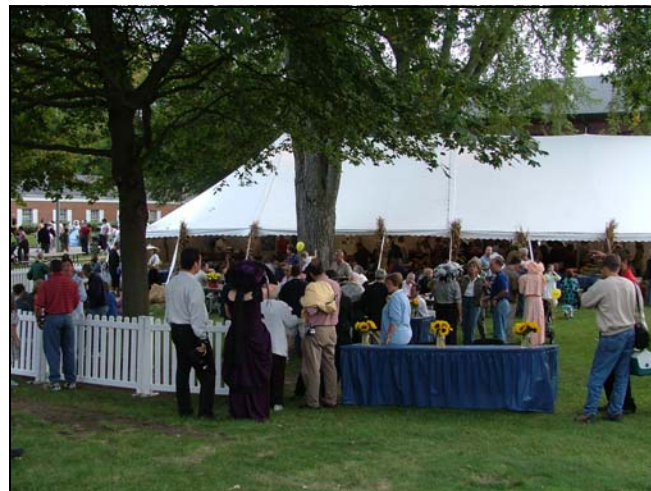
The Victorian Saloon takes place in the park behind City Hall (Wing & W. Cady)

Location: Downtown Northville Time: Friday (5:00pm - 10:30pm) Saturday (Noon - 10:30pm) Sunday (Noon - 4:00pm) Contact: Northville Chamber of Commerce 248-349-7640 or visit their website