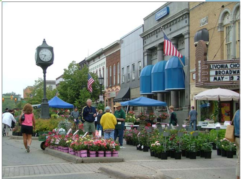
23rd Annual Flower Sale May 28-29

On Saturday, April 24th Downtown Northville was the setting for Avalon Films' latest TV commercial. Shooting was done on E. Main Street, Cady Street and various residential locations. We are told that this commercial will be seen throughout Michigan and several other states, although the locations and air dates have not been released yet.