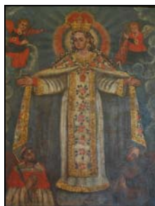
The Virgin Of Mercy With Saints

The exhibition will feature works by anonymous artists and artisans with the major focus on 18th century religious paintings from Latin America and 19th century Mexican Folk Retablos - small paintings of images on sheets of tin.