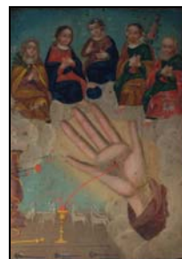
The Omnipotent Powerful Hand