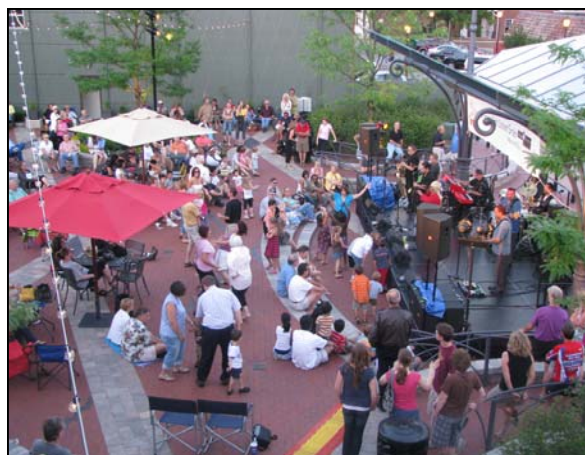
The season begins with Lady Sunshine & The X Band, a crowd favorite in 2008.