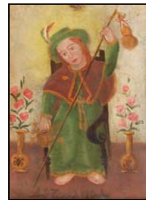
The Holy Child Of Atocha

Northville Art House ~ 215 W. Cady ~ 248-344-0497 www.northvillearts.org