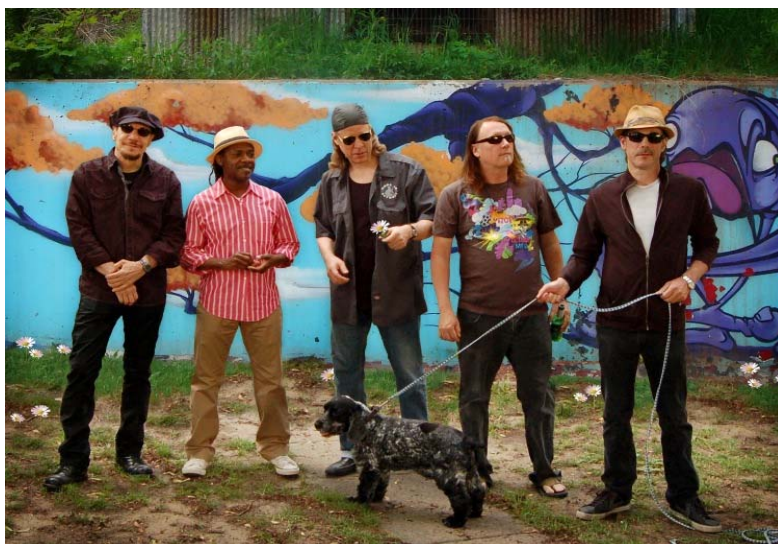
Howling Diablos will play the Main Stage in Town Square on Saturday night at 7:00pm.

This year's Fest is better than ever with a great musical line-up on two stages, a Kids Zone featuring magicians, clowns and fairies, a recipe contest, book signings by Michigan authors and much, much more. Show your support for The Mitten and join us for a weekend of fun-Michigan-style. For a complete event schedule, please visit the Buy Michigan Now Festival website .