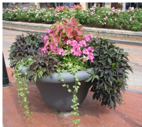
Downtown Summer Flowers