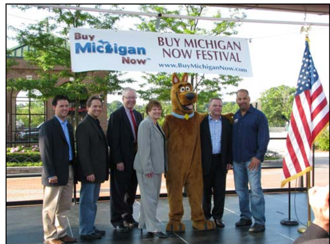
Dignitaries (and Scooby Doo) were on hand for the opening ceremony in 2009.

For a complete event schedule, please visit the Buy Michigan Now Festival website .