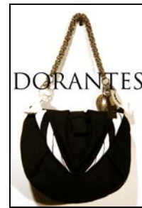
Bag Louis Dorantes