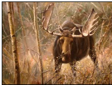
Northville Gallery ~ 123 E. Main ~ 248-465-9630 www.northvillegallery.com