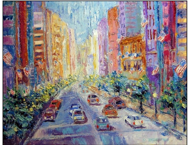
Starring "The Gallery" ~ 118 W. Main ~ 248-347-1642 www.starringthegallery.com